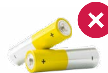
Batteries & Electronics