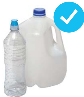
Plastic Bottles & Jugs