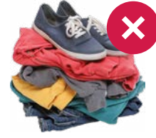
Clothes & Shoes