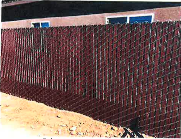
Privacy Chain Link Fence