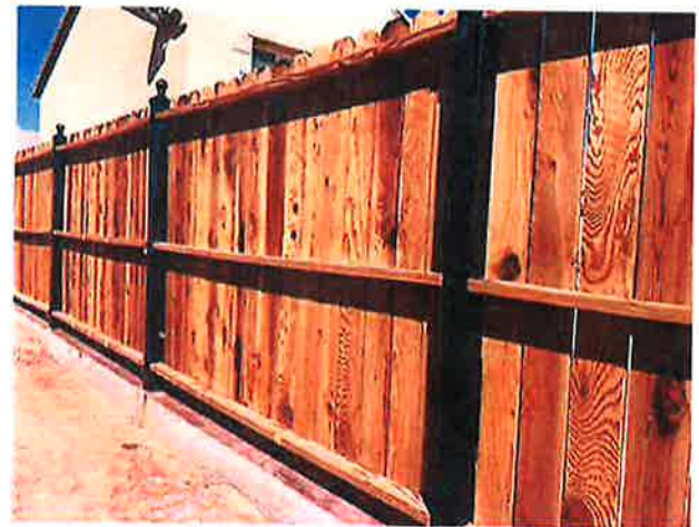
Ornamental Iron and Wood Fence