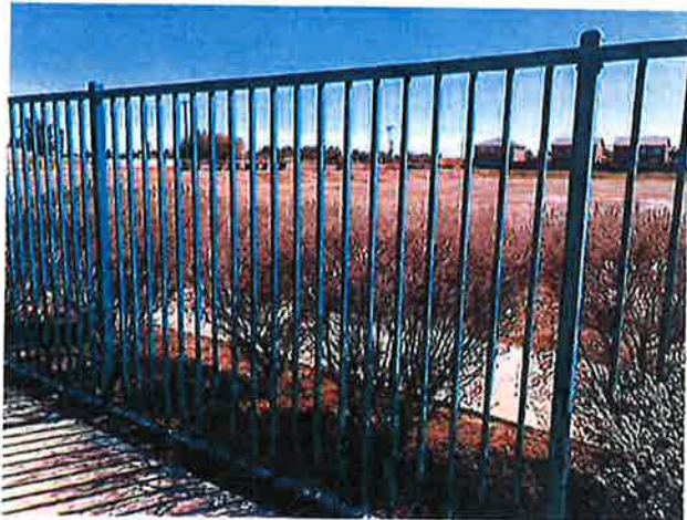
Ornamental Iron Fence