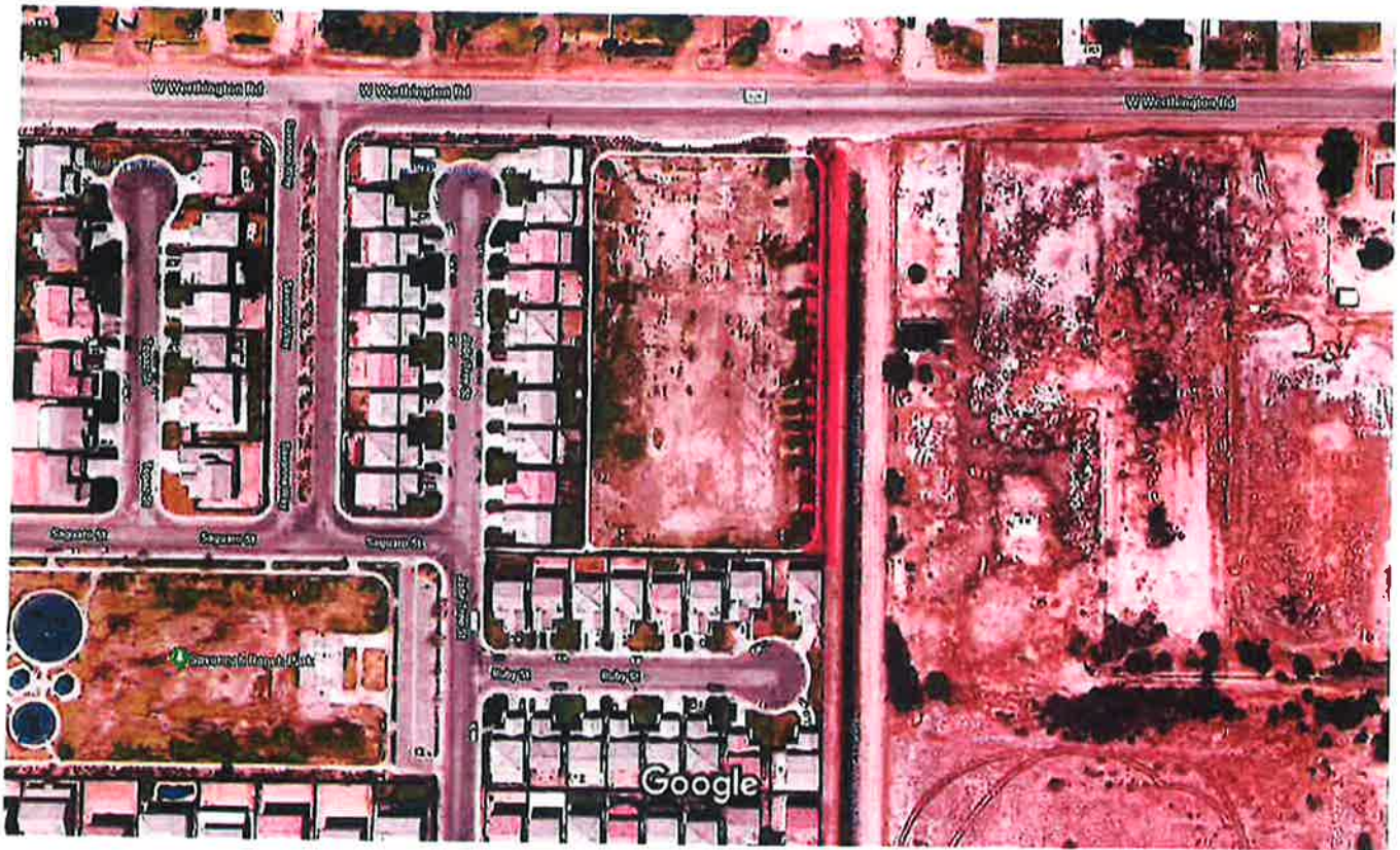
100 ft