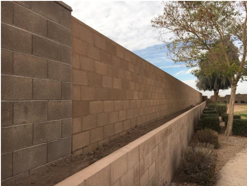
SKY RANCH CONCRETE MASONRY WALL PROJECT COMPLETED FEBRUARY 6, 2019