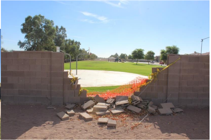
SKY RANCH CONCRETE MASONRY WALL PROJECT