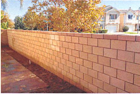
CMU Block wall Option