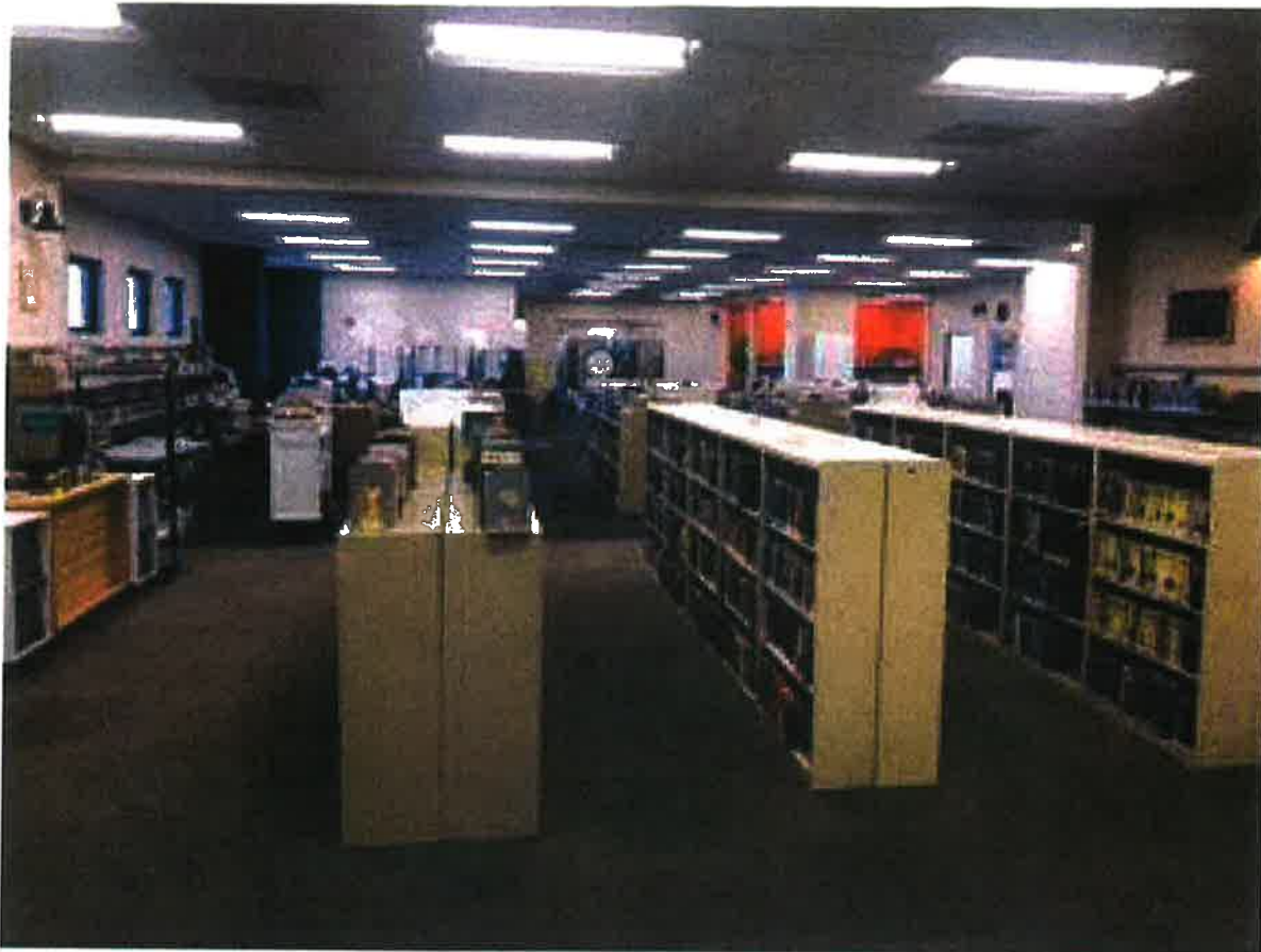
Present Children's Section of Imperial Public Library