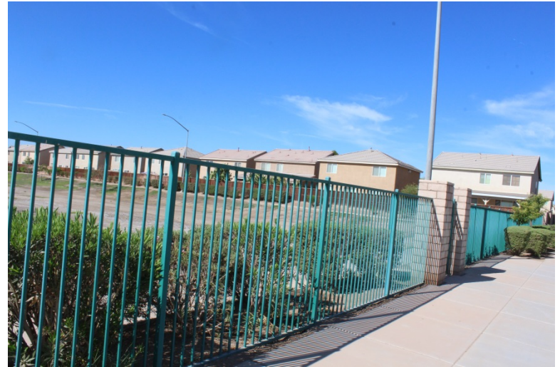
*Savanna Ranch Retention Park