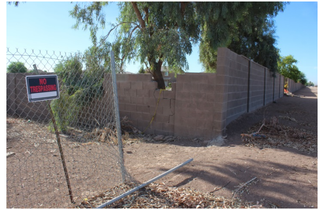
East to West – Approximately 2500 feet