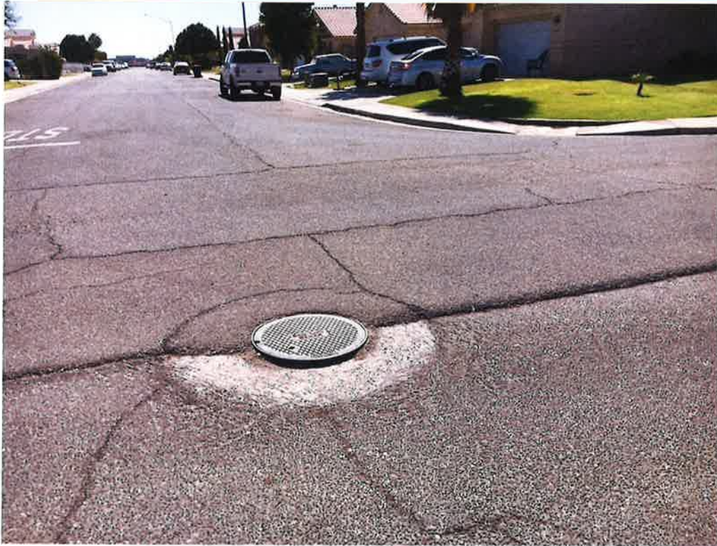
Exhibit 3 – Photo Report " ASPHALT RUBBER COMPOSITE LAYER OVERLAY ALONG PUERTO VALLARTA AVE FROM FONZIE AVE TO ROSARITO DR" CITY OF IMPERIAL BID NO. 2019-07