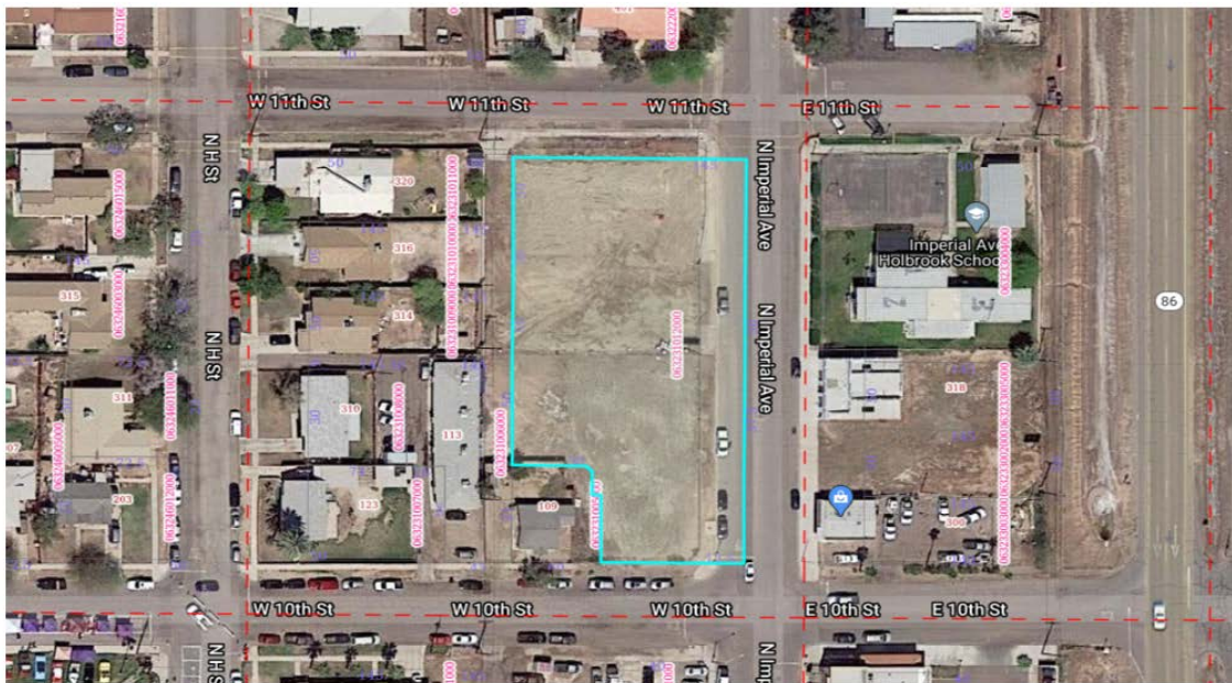
VAR (20_01)-Imperial Senior Apartment Project-Parking Reduction Request